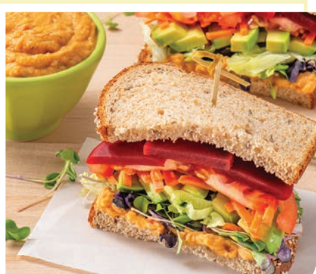
Vegan Rainbow Club Sandwich