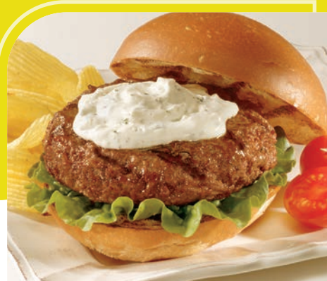
Burger Topped with Creamy Onion