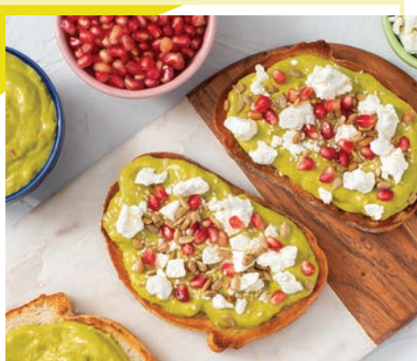
Pomegranate Goat Cheese Avocado Toast