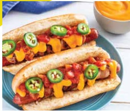
Sonoran Cheese Dog