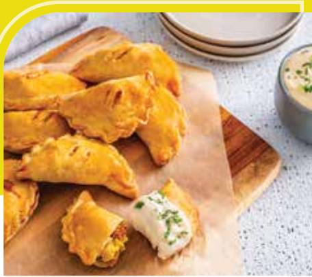
Chorizo & Monterey Jack Breakfast Empanadas