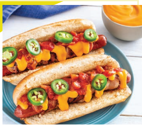
Sonoran Cheese Dog