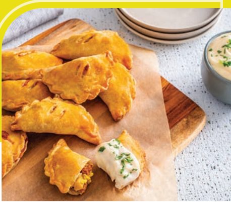
Chorizo & Monterey Jack Breakfast Empanadas