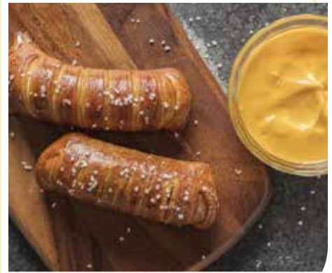
Pretzel Logs with Cheddar Cheese Sauce