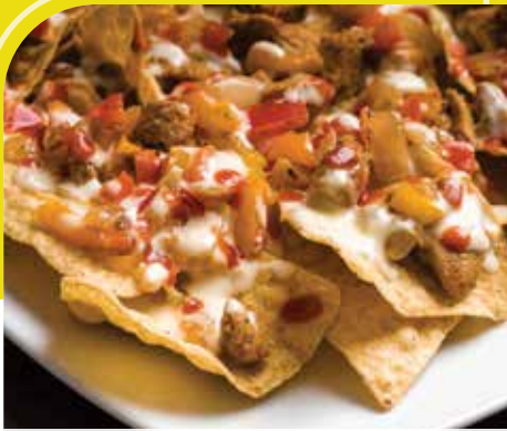
Nachos and Spicy Tomato Sauce