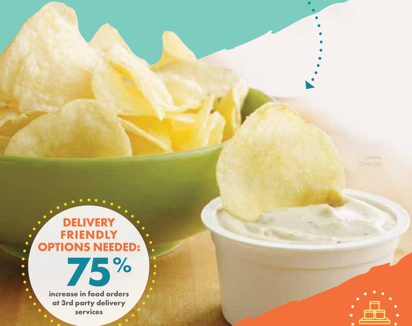
Creamy Onion Dip

Contactless delivery with our single-serve options.