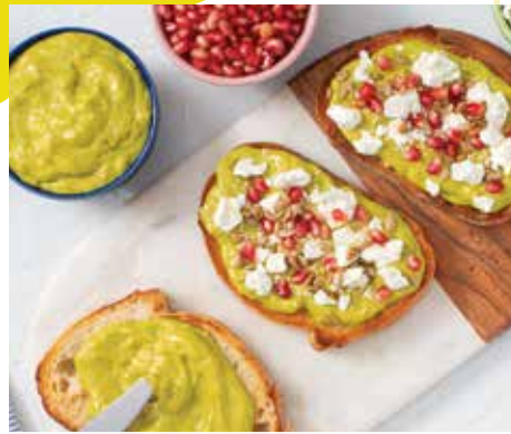
Pomegranate Goat Cheese Avocado Toast