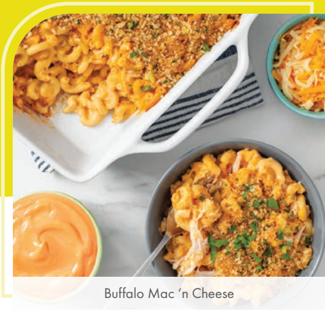
Buffalo Mac 'n Cheese