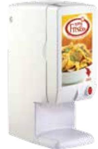
Available in Black or White with Customizable Machine Graphics