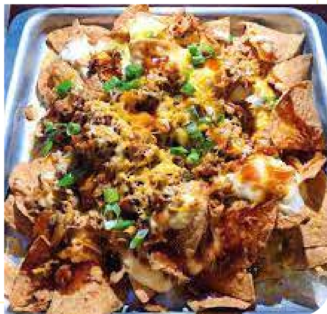
Smokin' Beef Brisket Nachos P.J. Whelihan's Pub & Restaurant