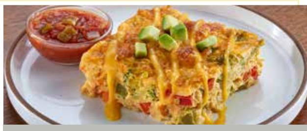
Chorizo Egg Bake with Muy Fresco® Nacho Cheese Sauce