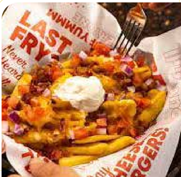
Loaded Baked Potatoe Fries Red Robin